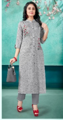
* 1003 *