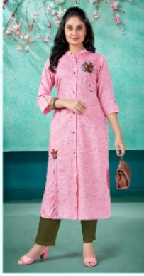
* 1002 *