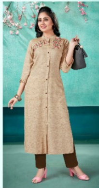
* 1006 *