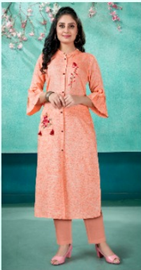
* 1004 *