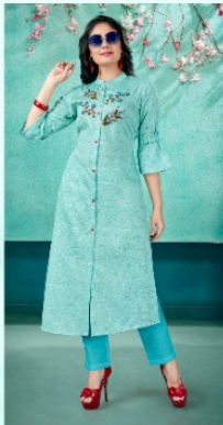
* 1005 *