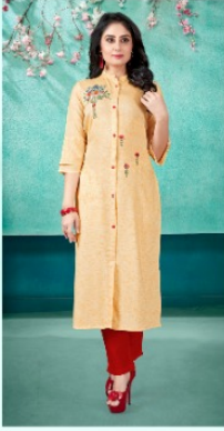
* 1001 *