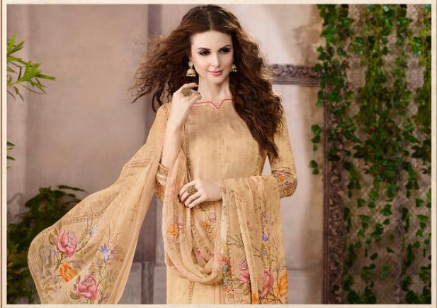
REAL CHARM Classic designs with feminine charm immerse yourself in this chic new style with the elegant luxury.