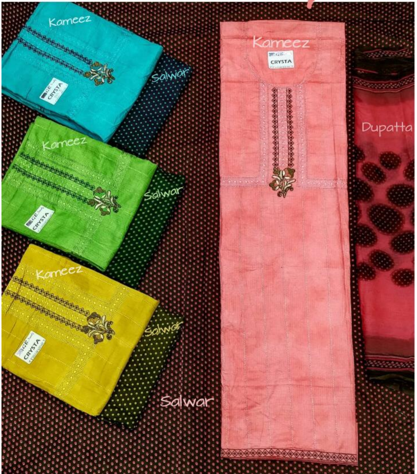
Top: Brush Paint Pure Cotton with Tone to Tone Thread work in front, along with fancy Flower Hand Work near Neck Bottom: Printed Polka Dots Pure Cotton which can be made into Blazed and Slack Plazo Dupatta: Pure German Viscose Printed which enhances the grace of the suit